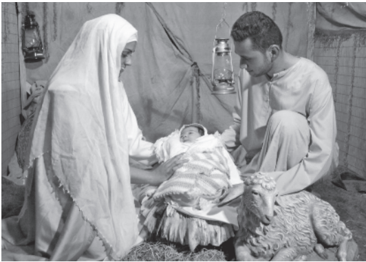
Iraqis re-enact the Nativity at the Ankawa refugee camp near Irbil, Iraq. Last year marked the first time in 1,600 years that Christmas bells did not ring in many Christian villages in the Middle East.

When advertising your event, ask all invited to share the spirit of Christmas by bringing a non-perishable food item for donation to families in need. Collect and deliver these items to your local food bank or parish food pantry. Be sure to keep track of these collections on the Food for Families Reimbursement Program form (#10057) and the Columbian Award Application (#SP-7). You might also use the opportunity to raise awareness of Christians in need throughout the world by speaking of the refugees unable to openly celebrate the birth of Christ due to religious persecution in the Middle East.