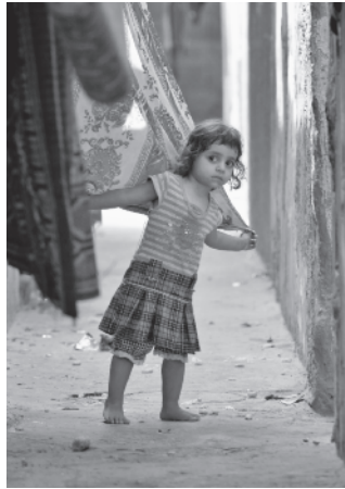
A girl stands on a street inside a refugee camp in Gaza.

Thank you for helping the Knights of Columbus to stand in solidarity with our persecuted brothers and sisters through participation in this program.